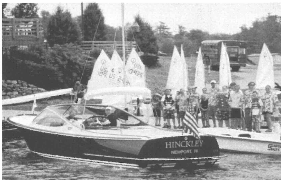
The kids from the Youth Sailing School wonder if the Hinckley is the LWSA's newest addition to the fleet!!!

"I would like to thank you for granting scholarship money to _____ this year. In past years I was able to send _____ without help. This year I needed help and you were able to give it to me. My children have great memories of these years, and talk about their experiences throughout the year.