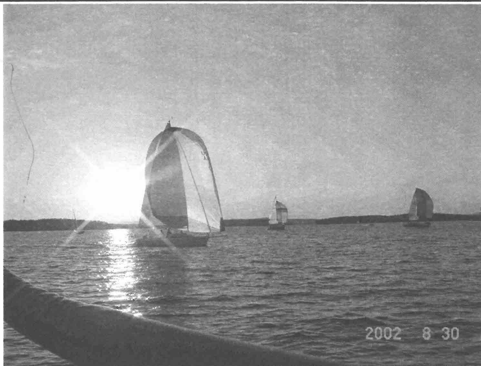
This sundown view of boats sailing in the Frying Pan Race seems appropriate for the end of year issue.